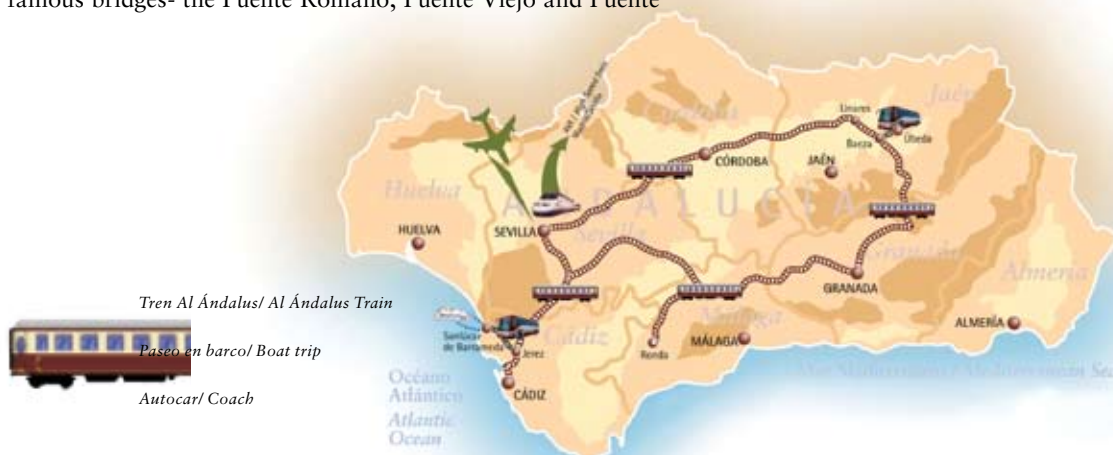
Tren Al Andalus/ Al Andalus Train

After breakfast, the train arrives Seville, the capital of Andalusia and Cultural Center of Southern Spain. This morning's tour includes visit to reputed World Heritage Sites such as the great and beautiful minaret tower - La Giralda, the famous Cathedral, the beautiful palace of Alcazar, the 13th century tower Torre del Oro and the Archivo General de Indias. Return to the Santa Justa train station where the train crew awaits to assist you with your luggage. Bid farewell to your new friends as you continue your onward journey.